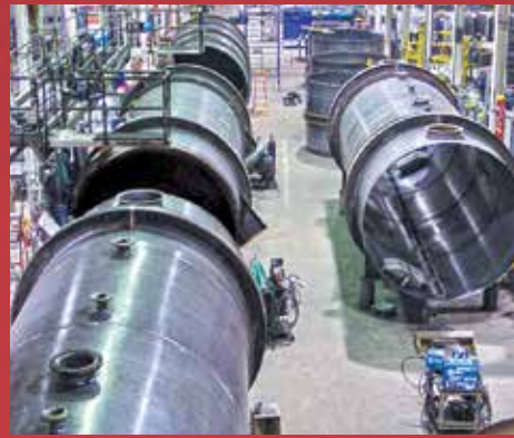
Atmospheric Storage Tank