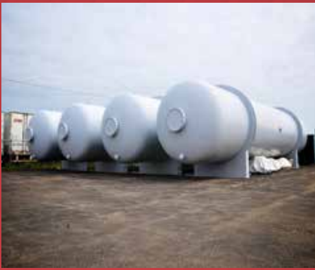
28,000 gallon Pressure Vessels