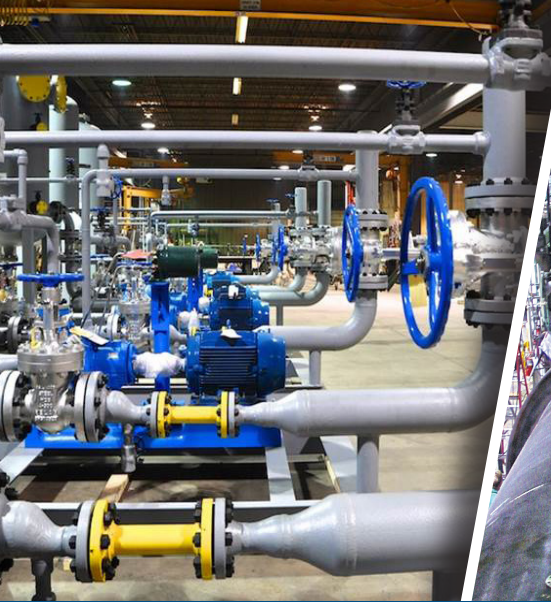
Vessel / Pump Skid Package