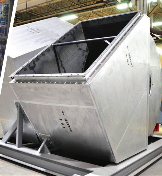
Industrial Ventilation System