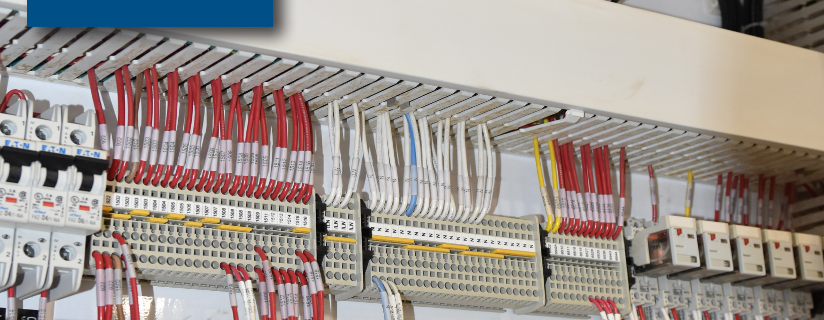
Industrial Control Panel