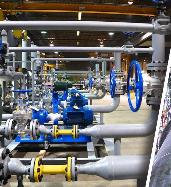
Vessel / Pump Skid Package